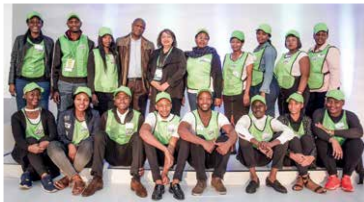
The Volunteers @ LIASA's 18th annual conference. The unsung heroes of LIASA!