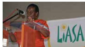
Deputy Minister of Arts and Culture, Ms Rejoice Mabudafhasi

people to take libraries to heart and to treat these as their homes so that destroying libraries and burning books become unthinkable.