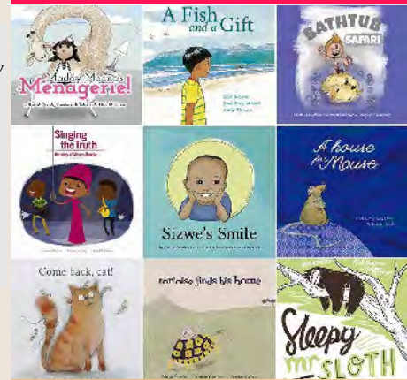
Some of the titles produced by Book Dash.